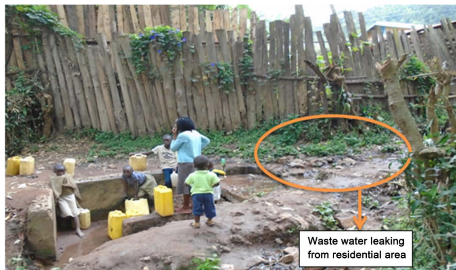
Plate 1. Water spring constructed in <5 m away from a residential area and wastewater was seen flowing from the residential area.